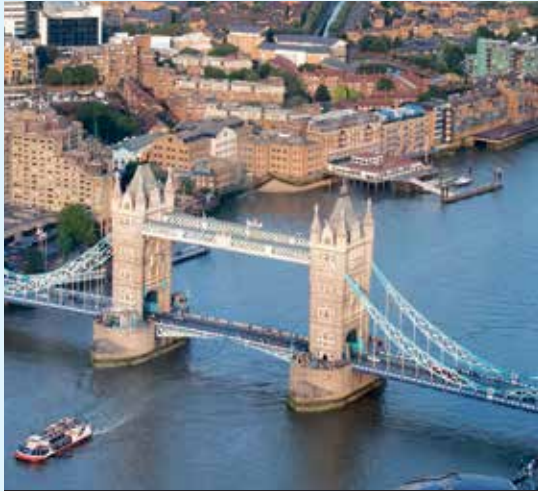
TRAVEL & TOURISM