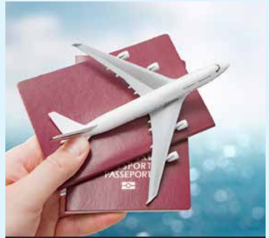
IMMIGRATION & CITIZENSHIP