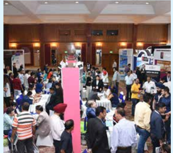
EXHIBITION & EVENTS